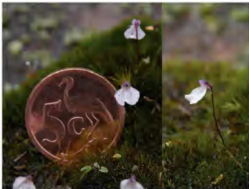
Figure 1: The tiny annual species, Utricularia brachyceras growing at the summit of Gifberg, Western Cape of South Africa. The scapes of this species are always 1-flowered. Note the lack of a gibbose palate and the very short spur of the corolla. For a scale: the 5 Rand cent coin is about 21 mm in diameter.

Meanwhile, it has been resurrected from synonymy in a new account for the Cape Flora (Manning & Goldblatt 2012), a decision which is fully supported by the author.